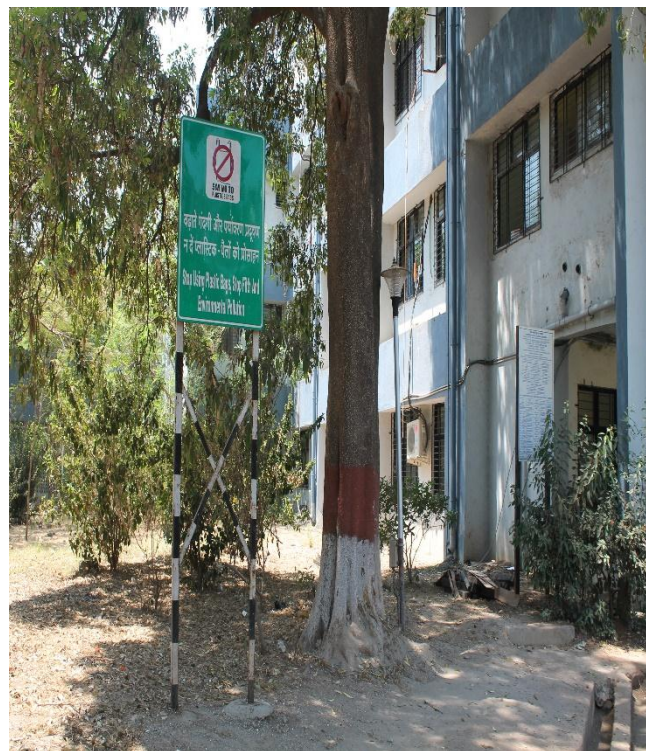
Removal of Debris After SWA in front of Hospital