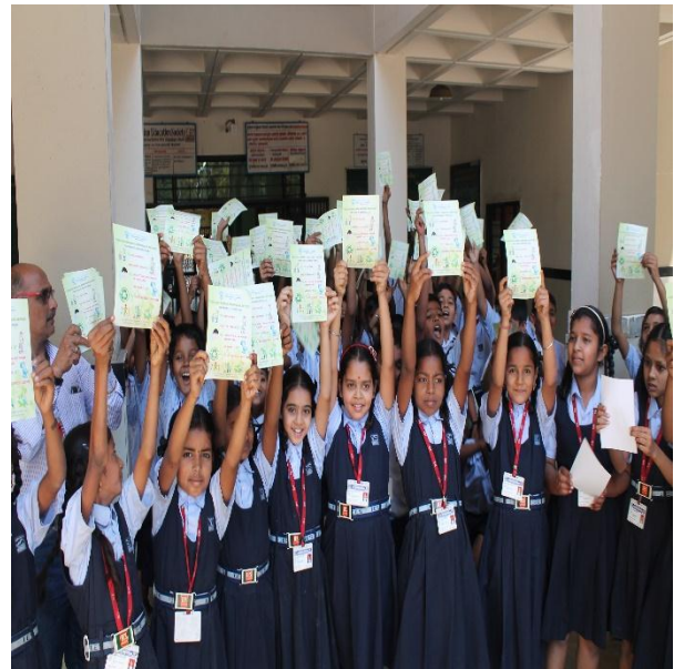
Distribution of Pamphlets about cleanliness in Administration Building and School