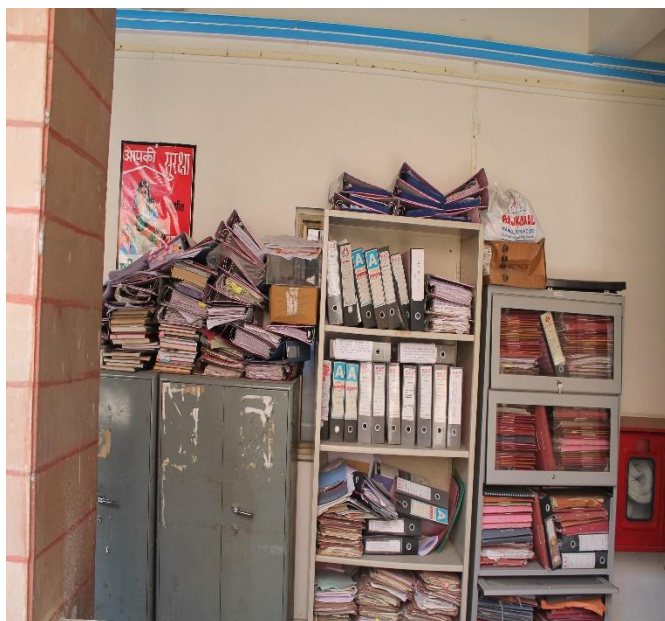
Files and cupboards in open corridor before SWA