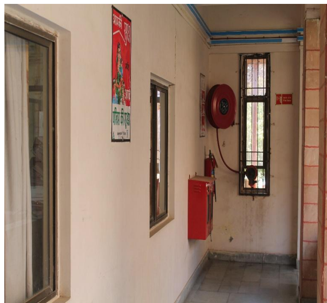
After Removal of files and cupboards in corridor under SWA