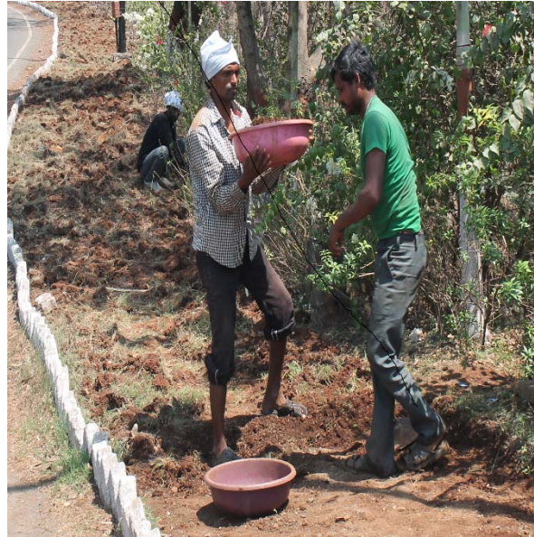
Lawn developed under SWA