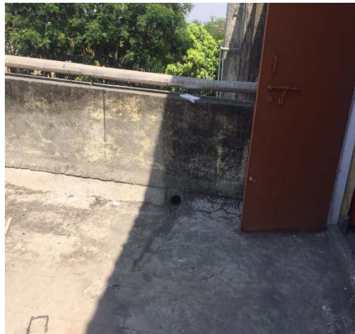
Removal of scrap items after SWA