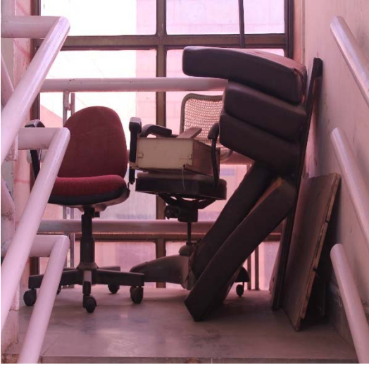
Unused furniture before SWA