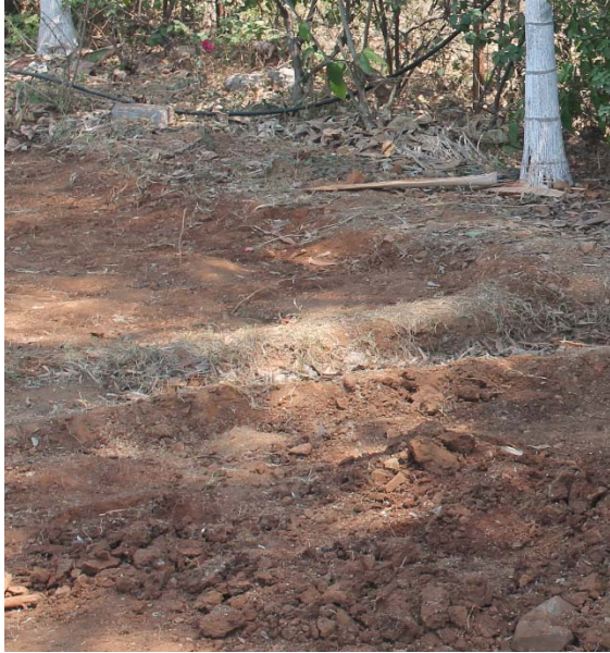
Open space before SWA