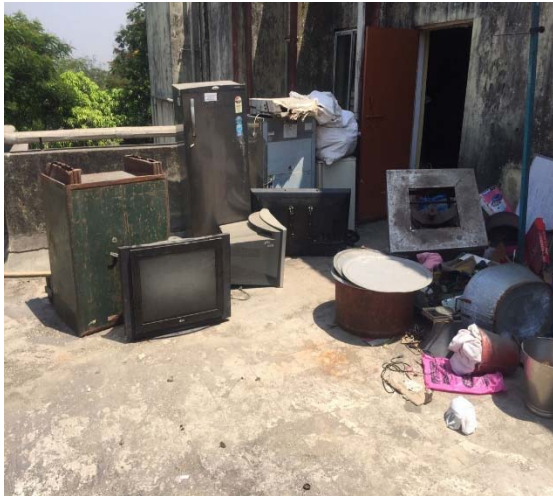
Scrap items before SWA at CISF campus