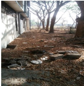
Open area before SWA