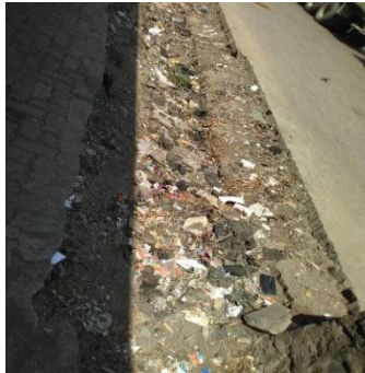
No cleaning of gutter before SWA