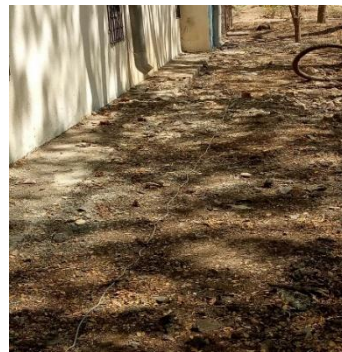
cleaning of open area under SWA