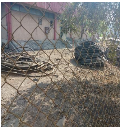
Accumulation of garbage before SWA at electrical substation