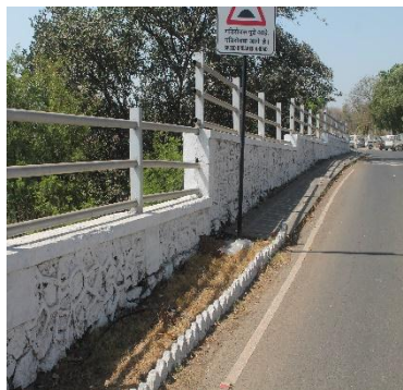
No cover of open space by Tiles before SWA