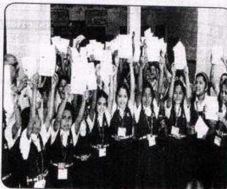
Pamphlets emphasising the significance of cleanliness were distributed amongst JNPT School children

On March 16 and 17, posters, banners and placards with messages on cleanliness were designed and placed at strategic locations. To further spread the 'Swachh Bharat Abhiyan' message, pamphlets on cleanliness awareness were distributed