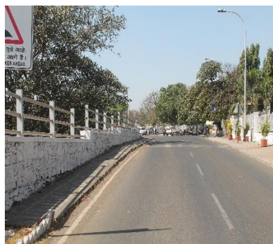
Cover of open space by tiles under SWA