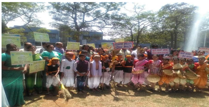
Street play by school children under SWA