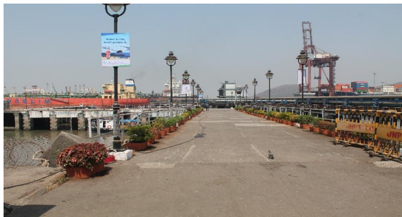
Placing of board at Landing Jetty