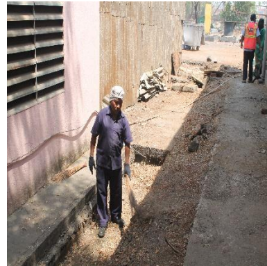
Cleaning of gutter under SWA in port area