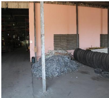
E-waste before SWA