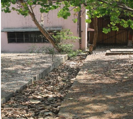
No cleaning of gutter before SWA in port area