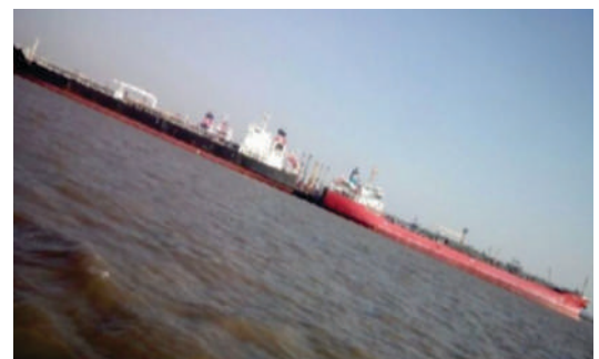
MT Ginga Panther and MT Atlantic Polaris berthed at JNPT

This achievement is a result of the constant endeavor of traffic department and Marine department of JNPT with co-operation from vessel master, to maximize utilisation of available infrastructure, helping to reduce the pre berthing detention of liquid cargo vessels.