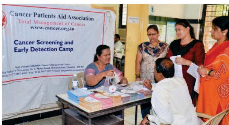
Expert doctor's team at JNPT cancer screening camp

The camp consisted of the expert team from ENTs, Gen. Surgeons, Gynecologists, Physicians and Counsellors who conducted various preliminary tests & which benefited 221 cancer patients.