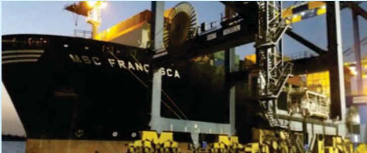
MSC Francesca on arrival at JN Port