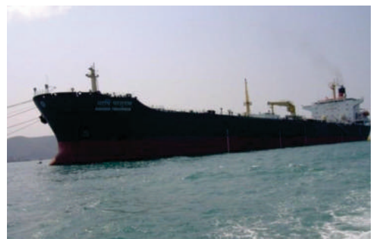
Maharshi Parashuram being loaded at Liquid Cargo Terminal

JNPT achieved another record when the Shipping Corporation of India's Crude Oil Tanker MT Maharshi Parashuram was loaded with 70,161.536 MT of ONGC's Mumbai Region for MRPL refinery (coastal movement). This is the highest quantity of crude oil loaded on a vessel during the last three financial years. It has set an example of synergies of resources of the public sector organisation in the development of nation. Moreover, with the availability of higher draught and infrastructure, JNPT is now the preferred destination for higher draught vessels.