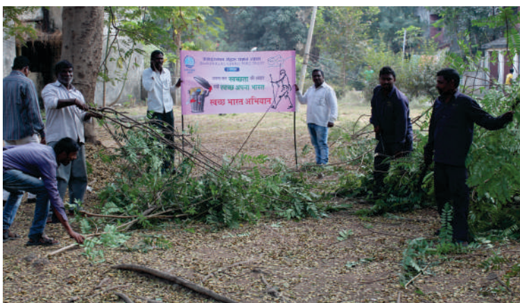
Swachh Bharat Abhiyaan being carried out at Port's township area