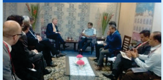
JNPT team in discussion with Hon'ble Shipping Minister Shri Nitin Gadkari