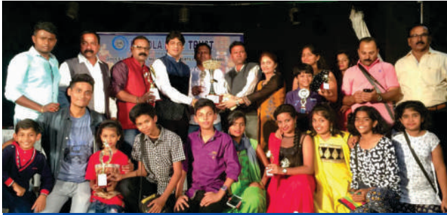
JNPT won All India Major Ports Cultural Competition Championship at Kandla